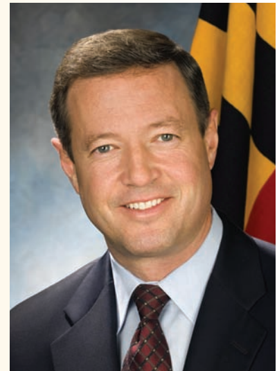
Martin O'Malley Governor

We are excited about continuing the development of programs and supporting the needs of Maryland's 463,000 veterans and their dependents.